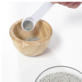
Measure Desired Amount

InstaMask™ granules are hard, but when water (or an aqueous booster) is added in a 1:1 ratio, the granules will hydrate and soften becoming a soft paste that can easily be applied on the face. The granules should hydrate for a minimum of 2 minutes before mixing.