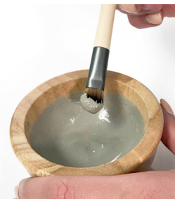
Ready to Apply