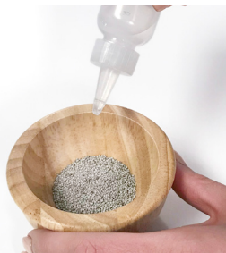
Add Water or Booster Formula